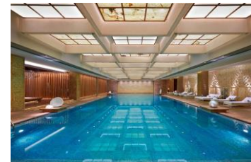
FITNESS & WELLNESS